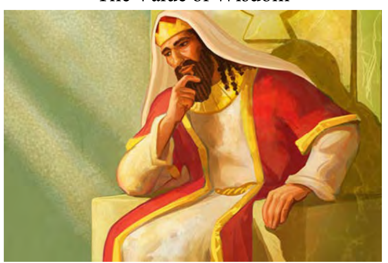
THE VALUE OF WISDOM